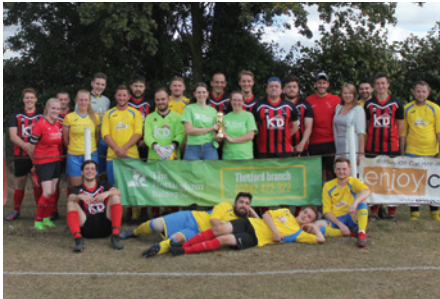
The Norfolk teams get involved in the charity football match's photo 'shoot'.

Our Thetford, Dereham and Fakenham teams held a fundraising football match and fun day raising £475 for local charity, Premier Foundation, which helps disengaged young people get on track.