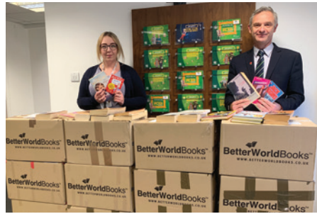
Our team at Shepshed with the first batch of donated books.

As a modern mutual, supporting the local community is hugely important to us. Since the start of our 'doing the right thing for our communities' programme (formerly Doing Good Together), the amount we have donated to help communities in our heartland prosper, reached £1 million. This total includes financial donations, gifts in kind, volunteering hours and fundraising.