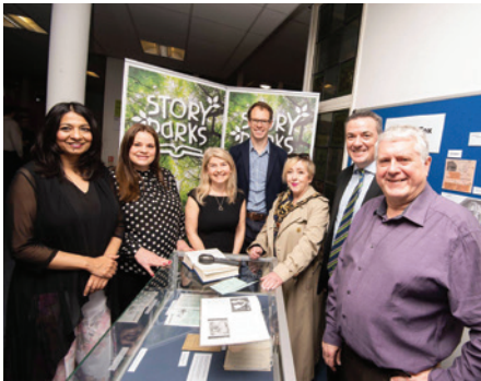
The launch of StoryParks at Nottingham's Central Library.