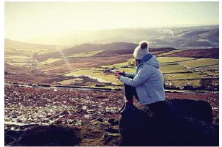
The gift of the great outdoors for Qualifying Members with The National Trust from July until October.

We demonstrate our commitment to rewarding savers across our heartland with the launch of the 'Special Saver' regular saver account with an interest rate of 2.5%. The account was hugely popular and was one of 40 new savings products we launched in 2019. We generally announce these on our website and social channels first so follow us to be the first to know.