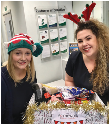
Our Sutton team's collection of seasonal snacks, chocolates and warm items such as socks, scarves and gloves for Framework.