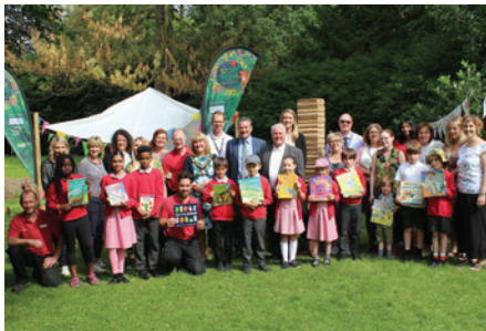
StoryParks event at Woodthorpe Grange in Nottingham with local school children.