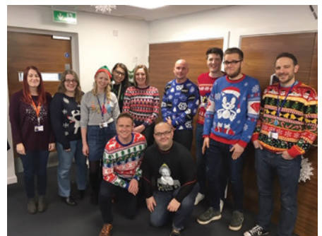
Some of our head office team taking part in Christmas Jumper Day.

Throughout December we supported our charity partner Framework's Off the Streets campaign. As well as giving donations from our Christmas Jumper Day to help tackle homelessness, our branches also hosted collections.