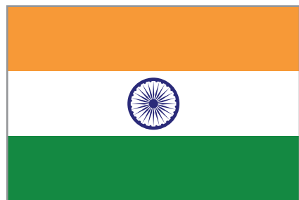
India, Indian rupees, ₹