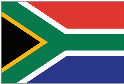
South Africa, Rand, R