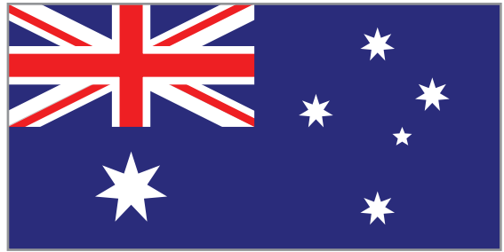
Australia, Australian Dollars, $