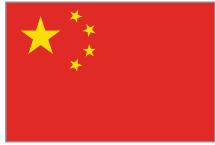
China, Remnibi (or Yuan), ¥