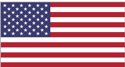
USA, American Dollar, $