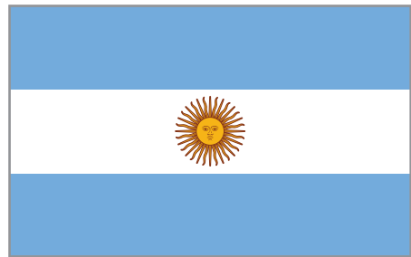
Argentina, Argentine pesos, $